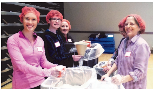
Holy Trinity Parishioners volunteering at the 2016 Helping Hands Relief Effort.

Lenten resources will be added weekly to our web site for parishioners to peruse and to utilize on your journey to Easter.