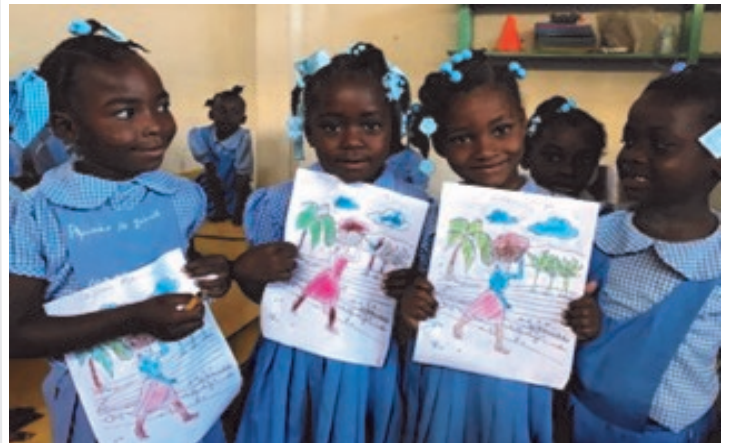
Kindergarteners at St. Joseph's School with coloring pages provided by Holy Trinity