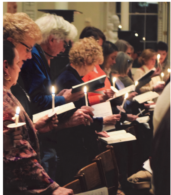
Parishioners light candles during an evening prayer in the Chapel last Monday for the Cheikho family and other refugees in need.