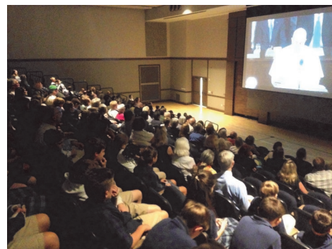
Holy Trinity parishioners and Holy Trinity School students watching Pope Francis' address to Congress in Trinity Hall.