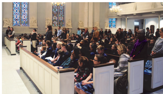
Holy Trinity Church and School staff and faculty receive the Commissioning Rite during the Catholic Schools Week Mass.