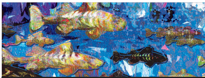
Xavier Cortada, "IXΘΥΣ" (Ichthys), digital art, 2015 (Detail). Art work created to welcome Pope Francis' climate change message and U.S. visit. ©2015 Xavier Cortada.

To add your name to the letter, see www.honoringthefuture.org/papal/ . Visit www.honoringthefuture.org to learn more.