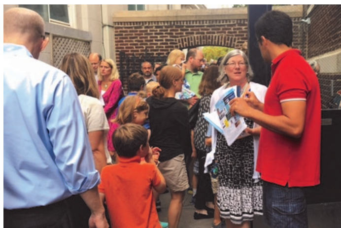
Above: Over 700 students attended our first Religious Education classes of the school year last Sunday.

Visit our website for more information about all of our Ministries and their programs. Sign up for our Holy Trinity eLetter for weekly updates!