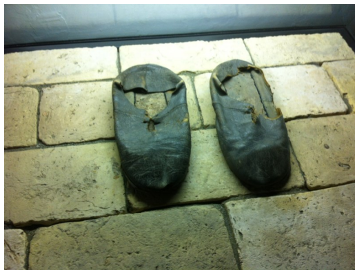
The shoes of St. Ignatius Loyola