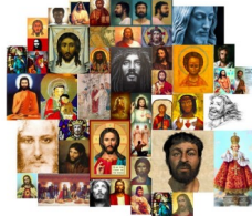
The Jesus Retreat

November 1-3; Register by October 13 at www.trinity.org/yac-retreat . We invite you to join other young adults as we journey together to explore who the person of Jesus is for each of us. The retreat is held at Camp Maria in Leonardtown, MD, and carpools are available.