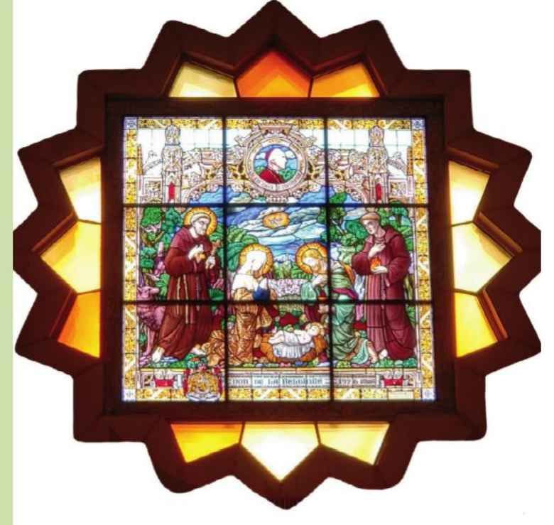
Stained glass located in the Church of the Nativity, Bethlehem

The Solemnity of Mary, the Holy Mother (Dec. 31 and Jan. 1), will return to the normal weekend Mass schedule except that NO MASS will be celebrated in Trinity Hall. The Trinity Hall 9:00 AM Mass will return on the Epiphany of the Lord (Jan. 8).