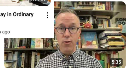
Reflection - Memorial of the Passion of Saint John the Baptist 08.29.23