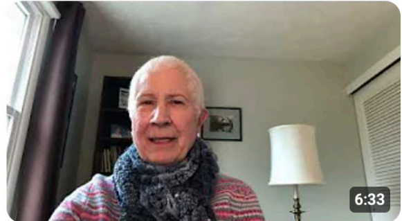
Reflection: Feast of Our Lady of Guadalupe