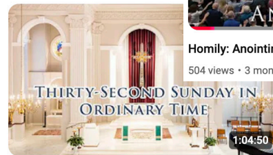
Mass – Thirty-Second Sunday in Ordinary Time – 11.12.23