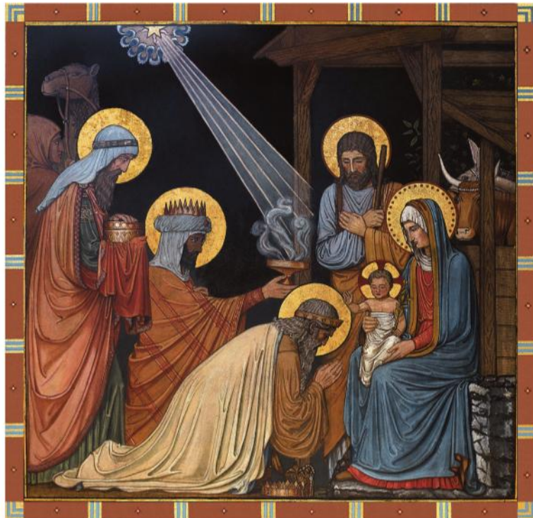
~ Adoration of the Magi Basilica of the Immaculate Conception at Conception Abbey in Conception, MO. by Benedictine monks in the late 1800s.