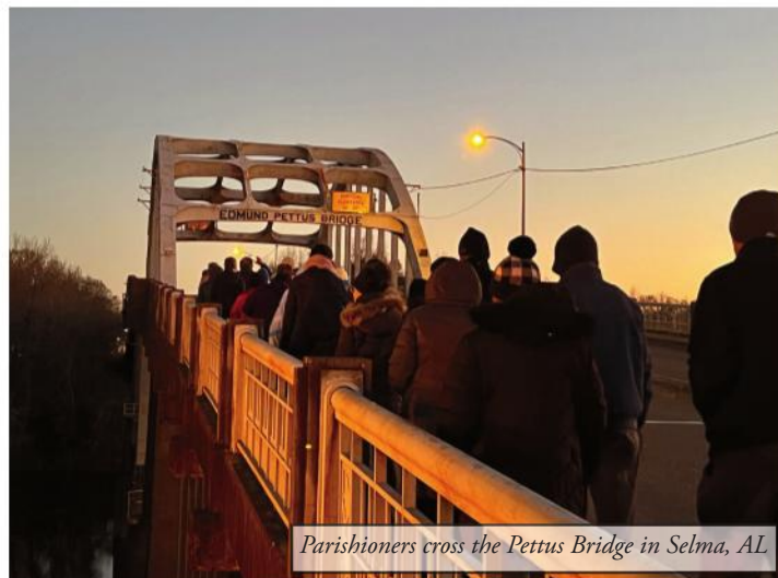
Parishioners cross the Pettus Bridge in Selma, AL

Through a series of informative and inspiring conversations, meetings and tours we encountered the trauma of the past and the tragedy of the present. History intersected with our own stories when our pilgrims visited the Dexter Parsonage (former home of Rev. Martin Luther King, Jr.), the historic and Catholic-sponsored City of Jude, the Legacy Museum: From Slavery to Mass Justice, the National Memorial for Peace and Justice, and the Freedom Monument Sculpture Park. The latter three sites are recent centers sponsored by the Equal Justice Initiative (EJI). Founded in 1989 by attorney and author