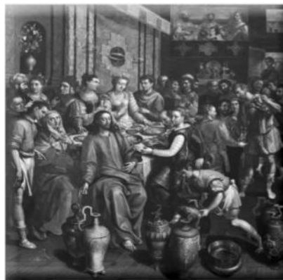
Marriage at Cana , Marten de Vos, c. 1594

Let Us Love in Deed and Truth, Larry King The Holy Trinity Choir