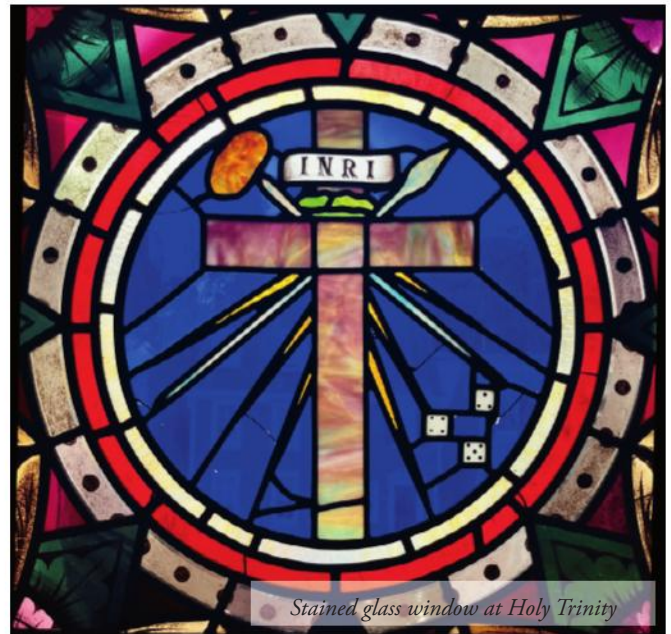
Stained glass window at Holy Trinity

If you haven't received an e-mail from us requesting your