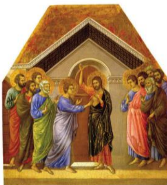
~ From a panel of the Maestà Altarpiece, Duccio, 1308 Siena, Tuscany

tri - umph won! Songs of re - joic - ing have be - gun. Al - le - lu - ia! has dis - persed. Let shouts of ho - ly joy out - burst. Al - le - le - ia! ty to reign. O let us swell the joy - ful strain. Al - le - lu - ia! por - tals fell. Let hymns of praise his tri - umph tell. Al - le - lu - ia! ser - vants too, that we may live and sing to you. Al - le - lu - ia!