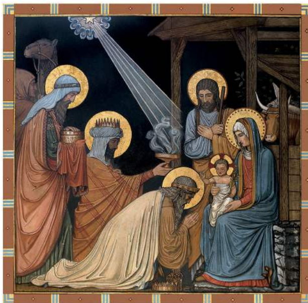
~Adoration of the Magi Basilica of the Immaculate Conception at Conception Abbey in Conception, MO. by Benedictine monks in the late 1800s.