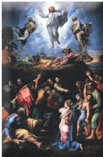
The Transfiguration Raffaello Sanzio da Urbino, AKA "Raphael"