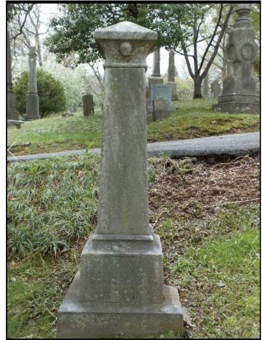
Grave of Mathias Duffy (d. 1852), architect and builder of Holy Trinity Church.

The interior is throughout admirable in taste and adaptation. Its proportions are about as follows: length 120 feet, width 65, height 40. On entering the main door at the west, the view is highly beautiful. The principal altar occupies the centre of the eastern end, and stands in a recess more detached in appearance from the main portion