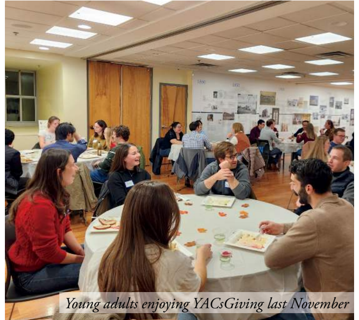
Young adults enjoying YACs Giving last November

The next non-negotiable that stemmed directly from my time away was that I had experienced Catholic communities for whom the celebration of Mass and the Eucharist were inextricably tied to both justice and transformative relationships with the vulnerable and marginalized. One