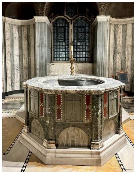
Baptismal Font at Westminster Cathedral in London. The octagonal shape of the font points to the "eighth day," the new creation in Christ.

In Catholic tradition, the font has often been described as the "womb of the Church." In those waters, Christians are born into Christ's Body. The Church has always known that beginnings matter and that beginnings are worth marking. Baptism is not a private milestone. It is the beginning of a new life in Christ. In ways suited to each time and place, the Church has sought to mark that beginning within her common life, as communities discern how best to express what they believe. Easter proclaims that Christ is risen. Baptism proclaims that we belong to his risen life. That belonging establishes dignity and responsibility.