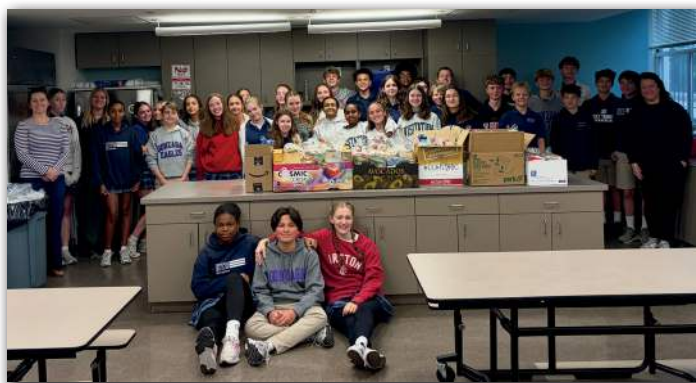
HTS Class Of '26 making their last round of sandwiches for the McKenna Center.

Although I may not remember my whole time here at HTS, I remember many of the important memories. I remember the friendships I made with the funniest and sweetest classmates. I remember fun events we had, like the father-daughter dance and Field Days. Even some of our most recent events, such as our zoo field trip with our 1st and 2nd grade buddies, or confirmation with many of my classmates. All of these events created memories that I'll never forget.