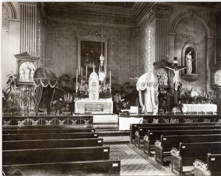
Holy Trinity interior, c. 1900

There was no shortage of saints' statues in Holy Trinity in its first 100 years, including a Pietà, and parishioners donated statues of St. Francis Xavier, St. Rita, St. Têrèse of Lisieux, and the Infant Jesus of Prague.