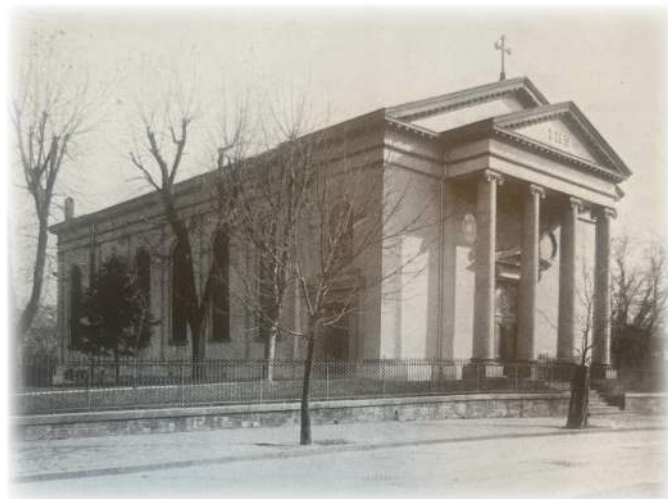
Holy Trinity celebrates 175th Anniversary of our Church building