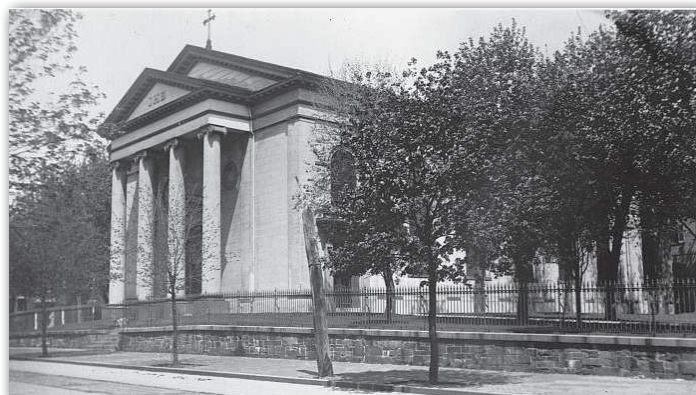
Exterior of Holy Trinity Catholic Church, c. 1909