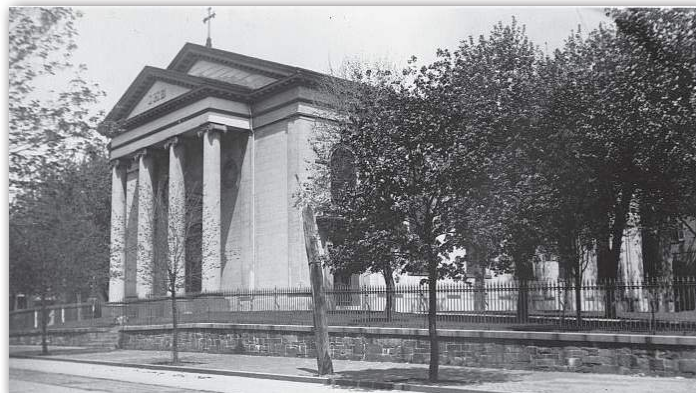
Exterior of Holy Trinity Catholic Church, c. 1909